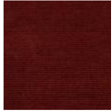
United 0743 Rouge 1034108