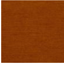
United 05EP Terra 1034106