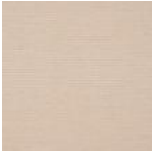
United A6A1 Bone 1034101