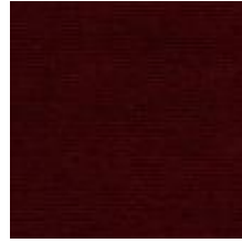
United 18A7 Bordeaux 1034109