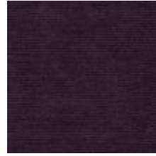
United 61B7 Purple 1034110