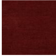
United 0743 Rouge 1034108