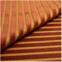
Noblesse 11 Rosa 1023711