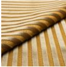
Noblesse 13 Ljusgrön 1023713