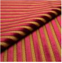
Noblesse 1 Röd 1023701