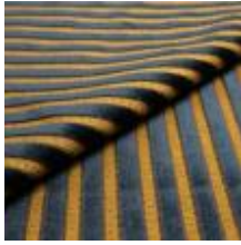
Noblesse 2 Blå 1023702