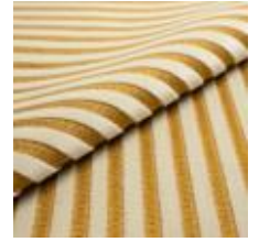
Noblesse 10 Vit 1023710