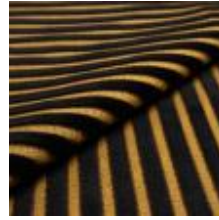
Noblesse 4 Svart 1023704