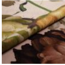
Maggio 05 Soft rose 1020703