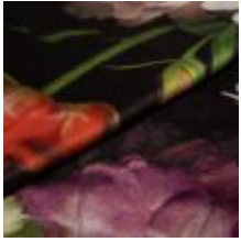
Maggio 01 Black 1020701