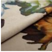
Maggio 02 Sand 1020702